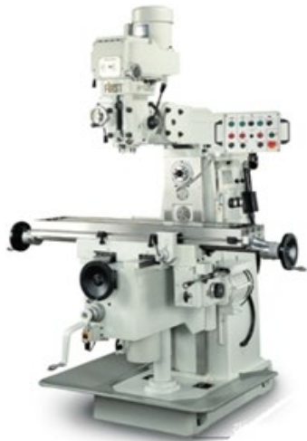
Model LC-20VHS illustrated