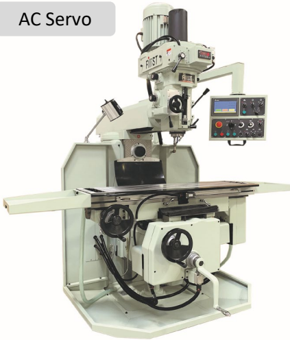
Model LC-205VHD illustrated