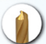
90°NC Spotting drill